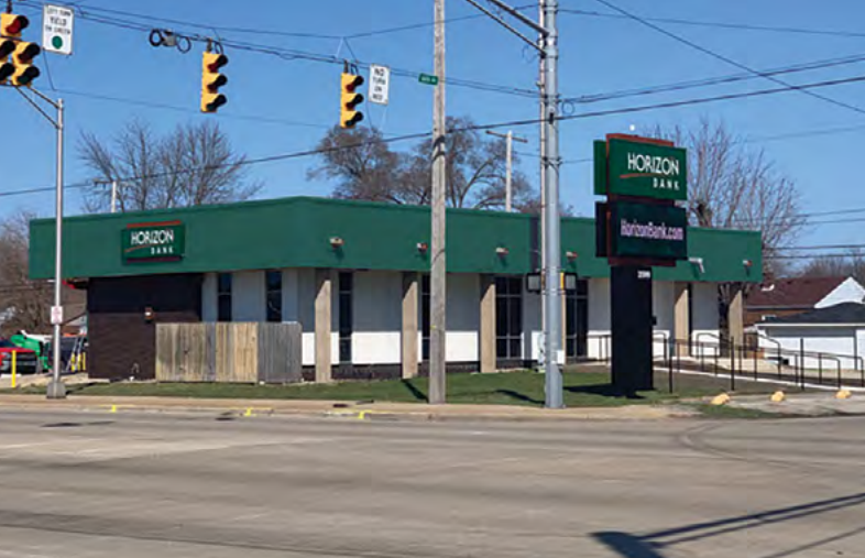
Horizon Bank branch in Gary, Indiana.

businesses. In addition to providing retail and commercial banking services to the Gary community, we were proud to support several nonprofits and initiatives in the region. Our Advisors also volunteered at several Gary non profits including: The Legacy Foundation, Guaranteed Income Validation Effort, Inc., Urban League of Northwest Indiana and Educate Create Innovate Entrepreneur Relationships (ECIER).