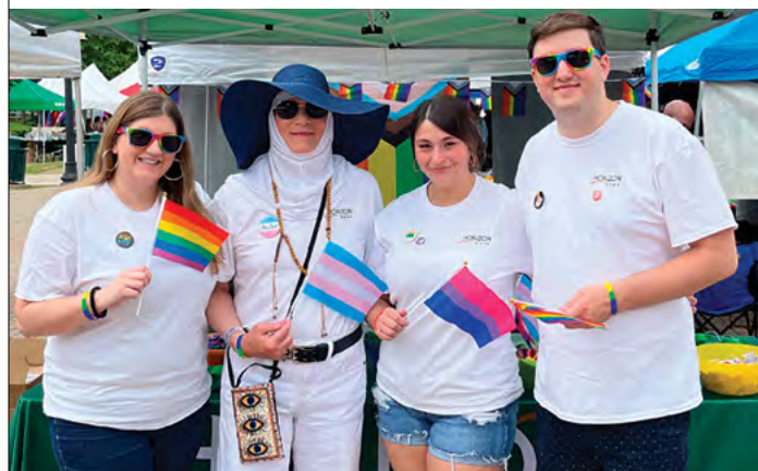
Some of our Voices of Pride LGBTQIA+ ARG members supporting Kalamazoo, Michigan Pride Event

Horizon introduced Advisor Resource Groups in 2021 to promote inclusion and diversity throughout the company. These voluntary groups are open to all advisors to foster an affirming environment and assist with educating and recruiting advisors, community outreach as well as identifying unique opportunities to assist the communities we serve.