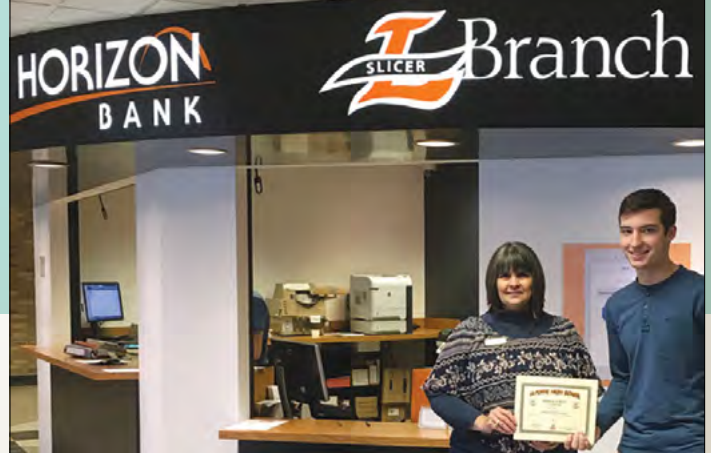
Banking on our youth. Student teller outside our LaPorte, Indiana high school branch.

Since early 2014, the Horizon Bank Michigan City High School ‘Wolves Branch’ has had an increasingly positive impact on both current and former students who have worked at the branch or been able to open accounts with ease. The skills that students have learned are invaluable tools that will help them succeed throughout their lives.