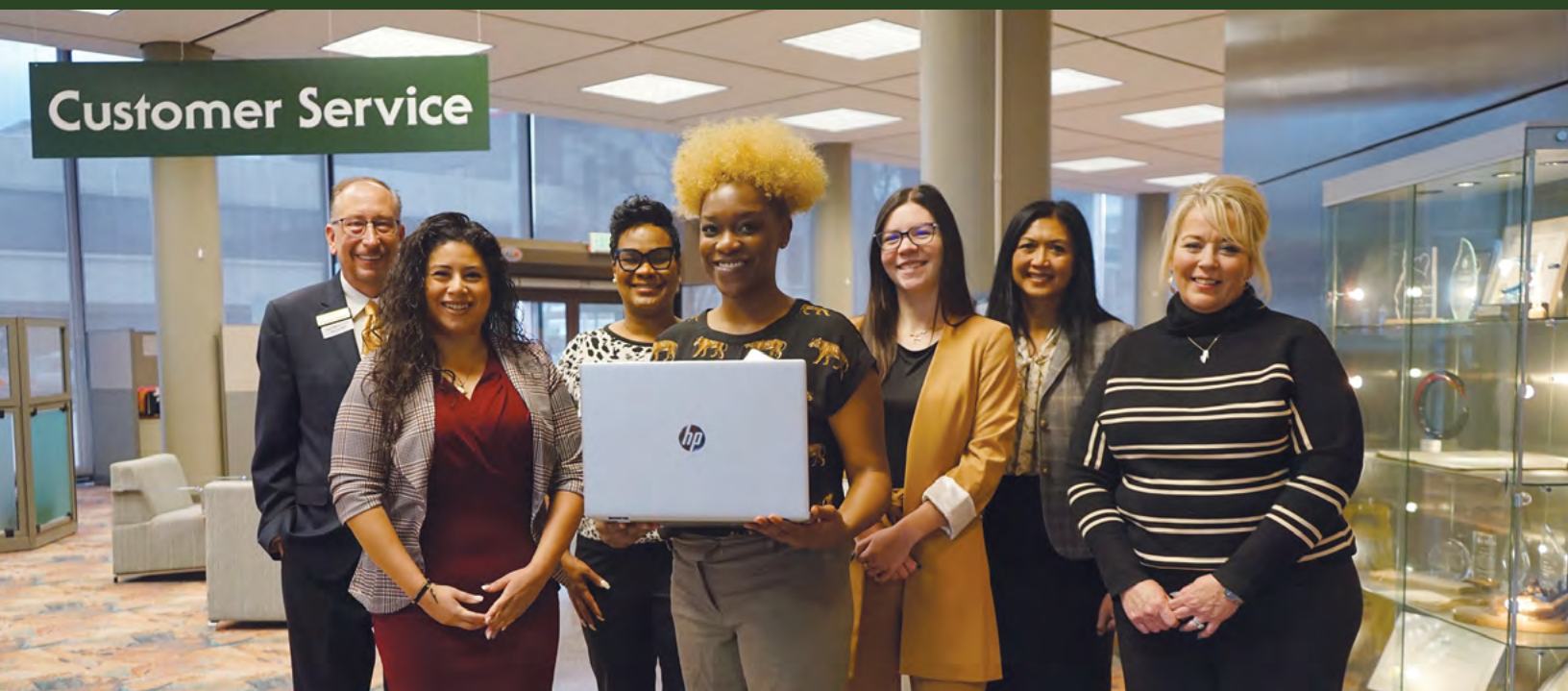
Our advisors in the main lobby of our headquarters in Michigan City, Indiana.

“Horizon Bank values and celebrates differences of all kinds among our team, customers, and business partners. We are intentional in how we approach diversity, equity and inclusion and are committed to continued growth and improvement.”