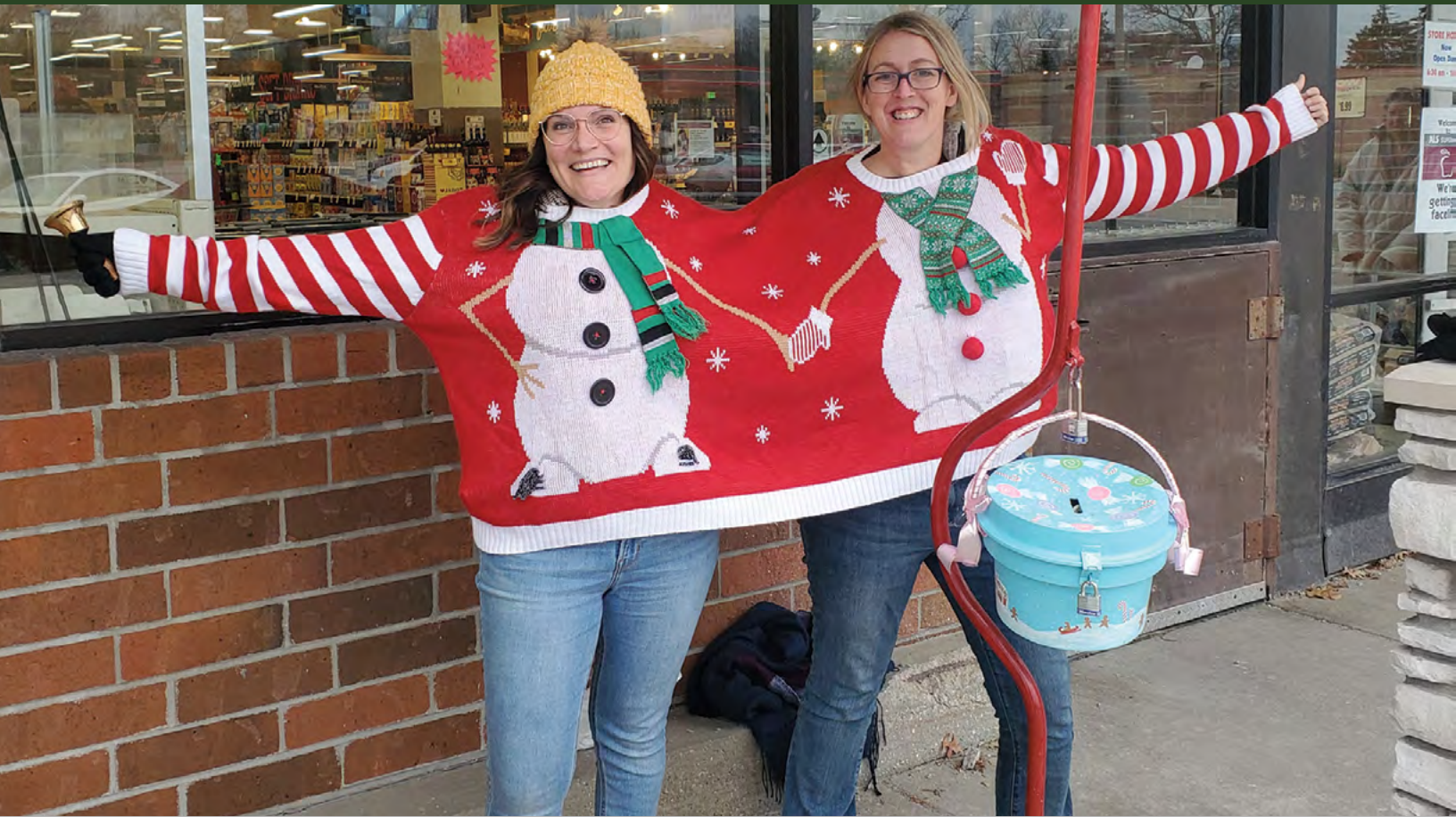
Michigan City Advisors volunteering in our annual Red Kettle Drive for the Salvation Army

Horizon Bank makes it a priority to rally together to support our communities facing significant challenges. Our culture of giving back permeates our entire company through our formal paid time off policy in which we encourage advisors to seek volunteer opportunities giving them freedom to support organizations and causes that are important to them.